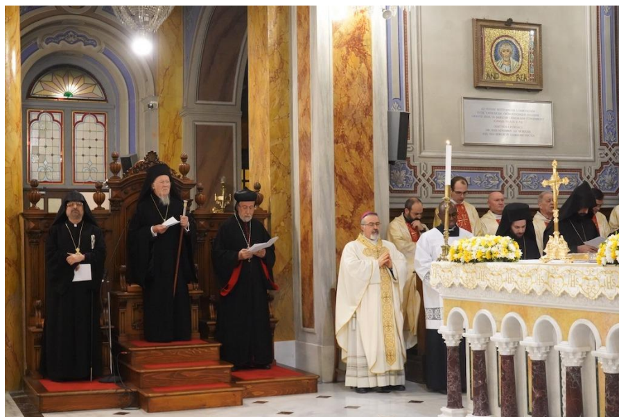
The Ecumenical Patriarchate participated in a heretical Latin mass, 19 March 2025.