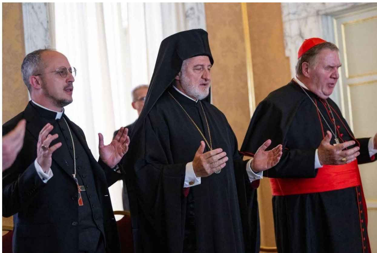
Elpidophoros praying with Papist Cardinal and Pope Leo XIV