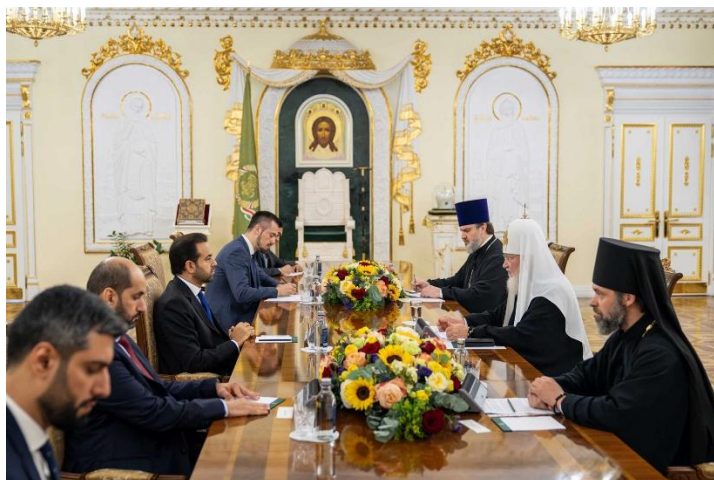
Patriarch Kirill (MP) & Muslim Council of Elders 19 June 2025