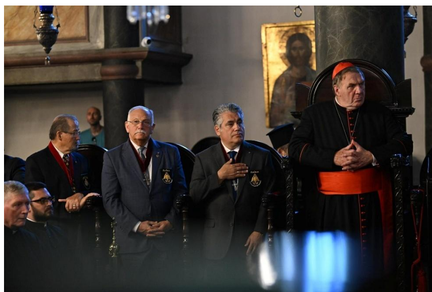
Cardinal Joseph Tobin on Throne during Divine Liturgy in the Phanar with Elpidophoros and Patriarch Bartholomew.