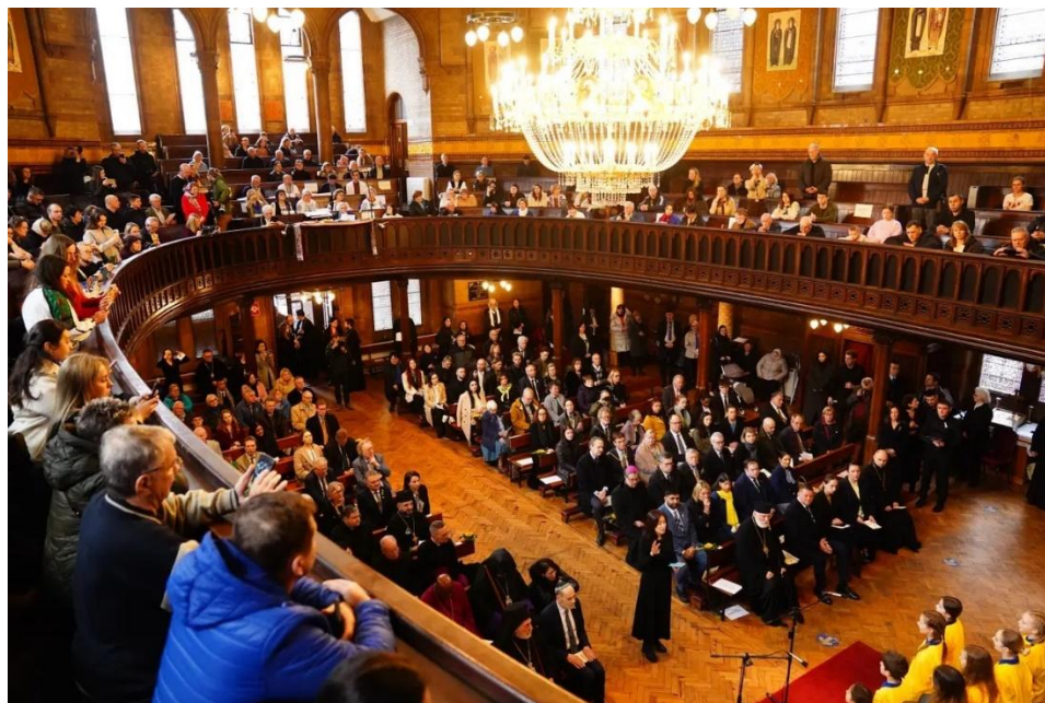
EP Archbishop, Nikitas of Thyateira praying with the heterodox at the Uniate Cathedral in London, 25 February 2025.

(Matrusov) of the Moscow Patriarchate’s Department for External Church Relations also took part online, offering a formal address to the gathering. 21