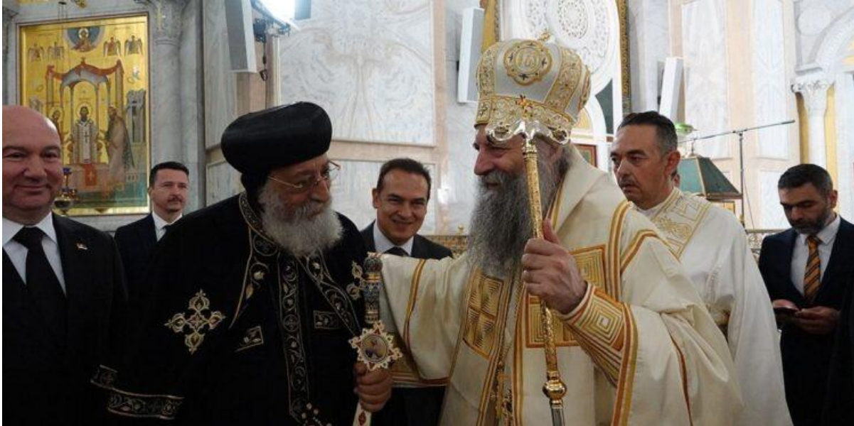
Patriarch of Serbia with Monophysite Coptic Patriarch 4, May 2025.