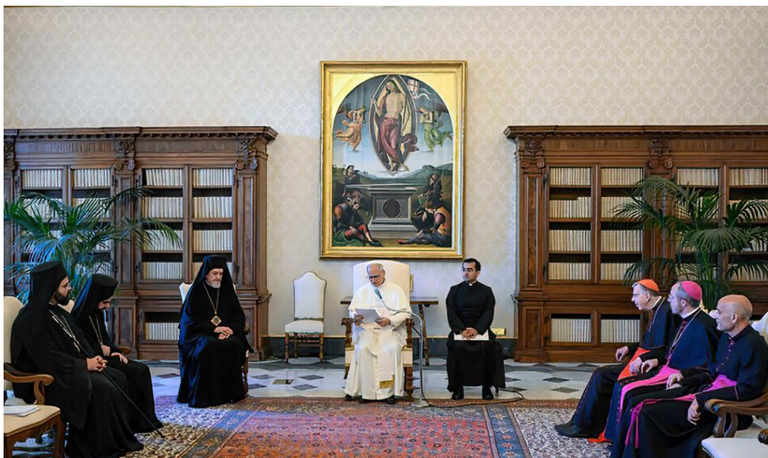
Metropolitan Emmanuel of Chalcedon with Pope

diplomacy and unity for the sake of unity, rather than based on genuine repentance and return to Orthodox confession 75