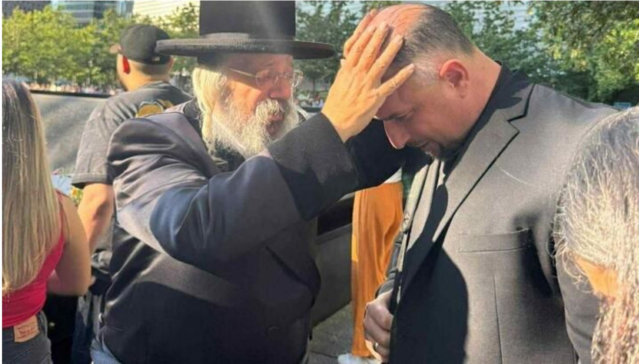
Rabbi blesses the Patriarchate of Constantinople protopresbyter.