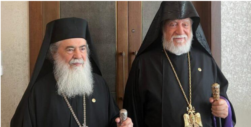
Patriarch of Jerusalem met Catholicos Aram I in Kazakhstan

During the closing ceremony, Patriarch Kirill praised the congress as a global interfaith platform, stressing cooperation among diverse religions despite their doctrinal divisions. The congress ended with the adoption of a final declaration affirming such collaboration. This event marked yet another instance of the Moscow Patriarchate's open participation in the pan-heresy of ecumenism. By treating false religions as partners in a common spiritual endeavor, its leaders acted contrary to the apostolic and ecumenical canons, which strictly forbid joint prayer and syncretistic assemblies with heretics and unbelievers. Far from upholding the Orthodox confession, the Moscow Patriarchate aligned itself with interfaith initiatives that obscure the truth of the Gospel and compromise the purity of the Church. 106