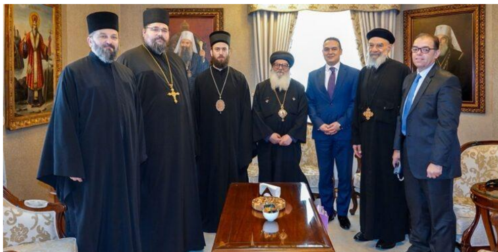
Serbian Orthodox Delegates with the Monophysite Copts, 11, April 2025

Each of these dioceses of the New Calendarist State Church of Greece issuing ecumenistic greetings and “blessings” to the Islamic communities in Orthodox lands who continually deny Christ and the Orthodox faith. 32