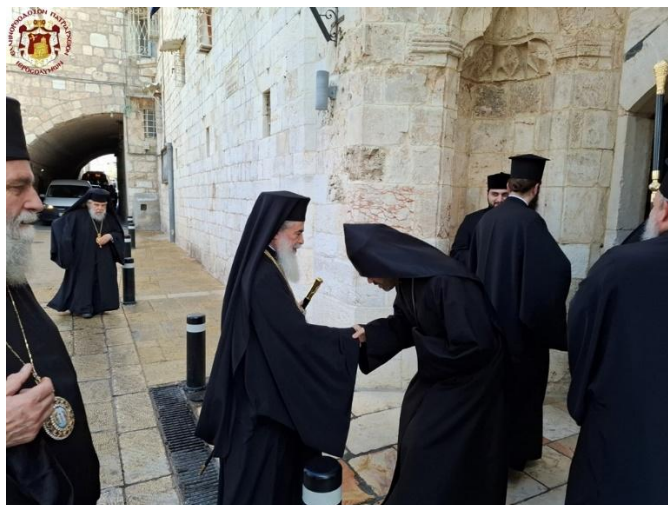
Patriarch Theophilos (JP) meeting with Armenian Monophysites of Jerusalem 21 January 2025.