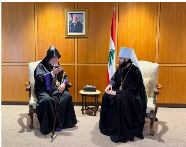
Met Anthony of the ROC-MP and Aram I of the Armenian Monophysites, 17 May 2025.