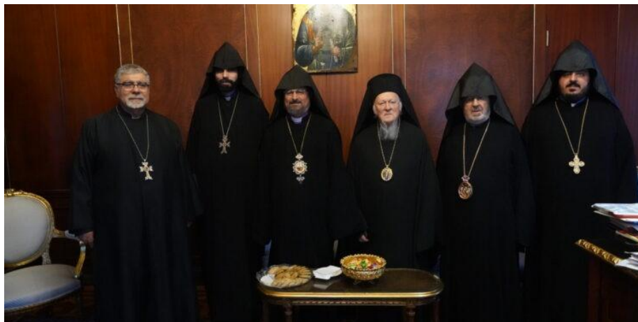
EP Meeting with Armenian Monophysites 1 January 2025.