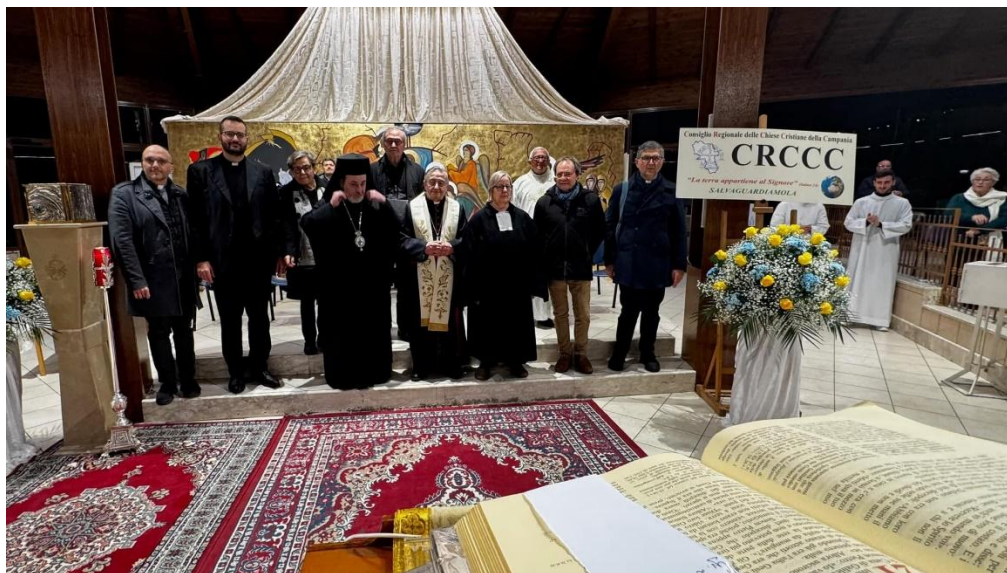
Ecumenical Patriarchate Bishop of Italy in Joint Prayer with Heterodox 25 January 2025.