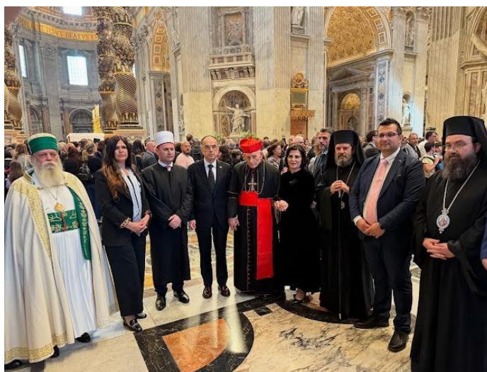
Albanian Orthodox Representatives with the Heterodox in Rome

This gathering—celebrated under the guise of brotherhood—was in fact a scandalous display of pan-heresy and a betrayal of Orthodox ecclesiology. The participation of canonical Orthodox bishops in shared prayer and liturgical acts with heretics constitutes a grave canonical and theological breach, evidencing the ongoing erosion of Orthodox boundaries through ecumenism disguised as pastoral sensitivity. 40