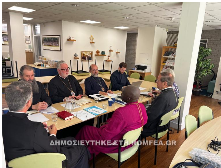
Anglican Bishop in Red