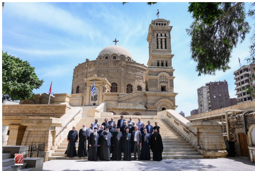
3rd Meeting of the 18th Plenary of the International Joint Commission for Theological Dialogue between the Orthodox Church and the Lutheran World Federation

appearances and networking rather than genuine theological discourse. This meeting symbolizes a worrying alignment that many believe strays farther from the true path of Christianity. 61