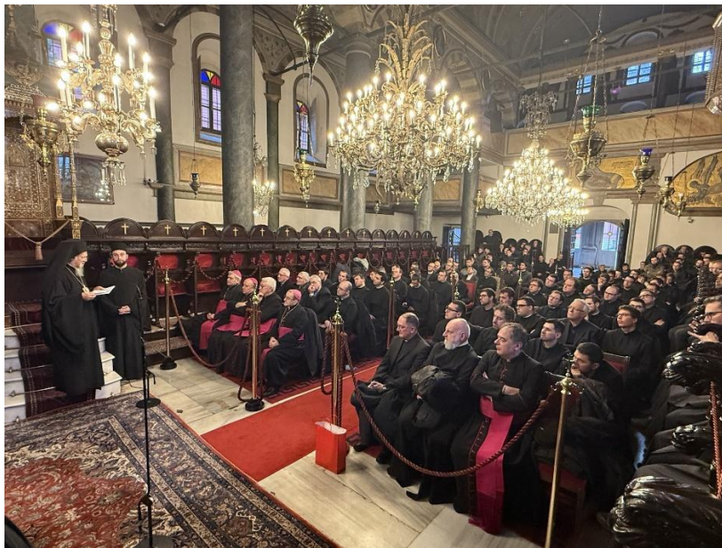
Patriarchal Heresiarch Bartholomew with Papist Clergy at the Phanar, February 18, 2025.