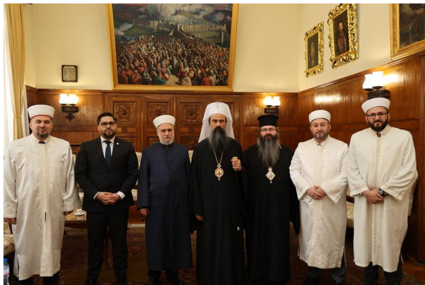
Patriarch Daniel of Bulgaria and Islamic Mufti engaging in Ecumenist and Perennialist Dialogue, February 18, 2025.

between the Ecumenical Patriarchate and the Roman Catholic Church, further solidifying the Patriarch's commitment to ecumenical dialogue and the pan-heresy of ecumenism. 16